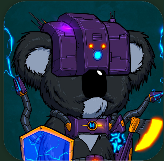
Cyber Hedera Koala 6 in the kollection

Over the next several months and years, we will continue to collaborate with other well established, legitimate projects in the Hedera NFT space.