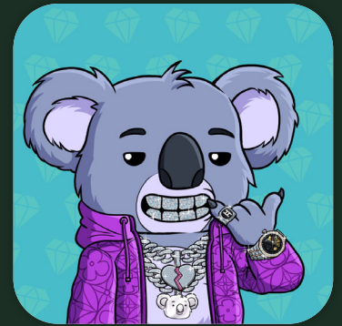
Ultra Koalas 5 points