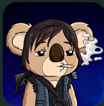
Zombie Survivors 9 points