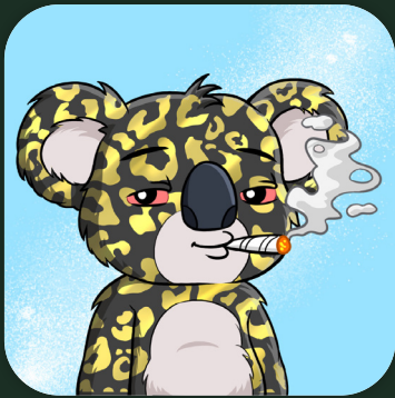
Regular Koalas 1 point

For instance, the more points you have, the higher the Tier you can farm in (higher tiers equal better harvests/prizes). Same concept for staking: the more points that you have, the more $KHK you earn on a weekly basis.