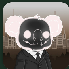
The HBAR Gremlin