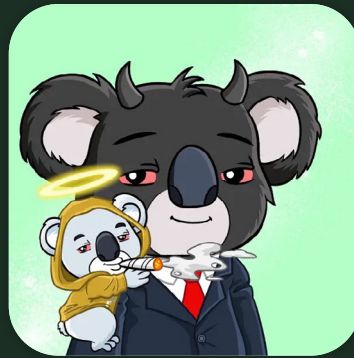
Joey Koalas, Zombie Koalas, & F1 Koalas 3 points