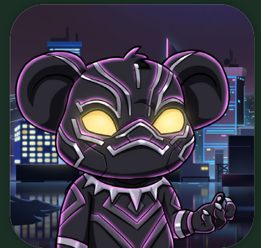
EVIP Koalas 12 points