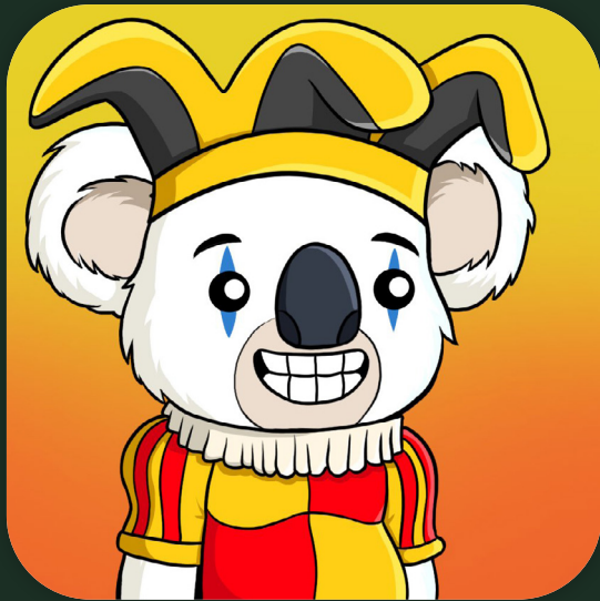
Lazy Superhero Koala 10 in the kollection

Over the past year, Koala Hash Klub has collaborated with several major projects in the Hedera NFT Space including: Lazy Superheroes and Cyber Hedera.