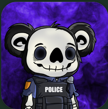
Ultra Joeys, Ultra Zombies, & F1 Joeys 7 points